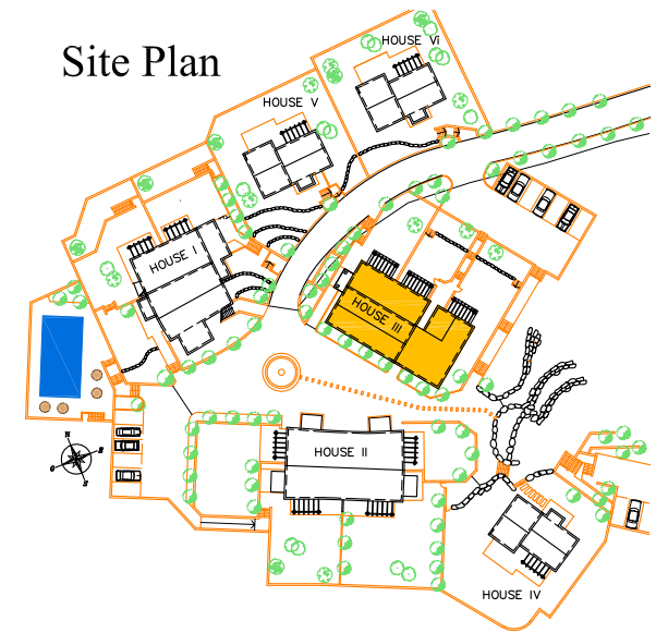
House III Apartment C Ground Floor m 2 : 80.32 Garden m 2 : 197.00