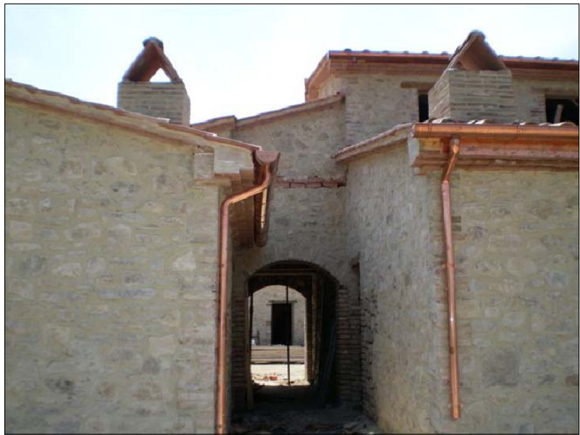
Passageway to apartments B and C