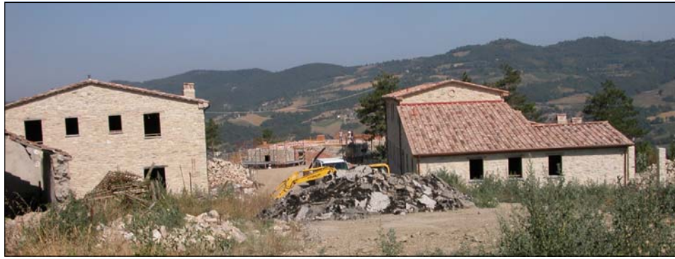
Houses II and III under restoration